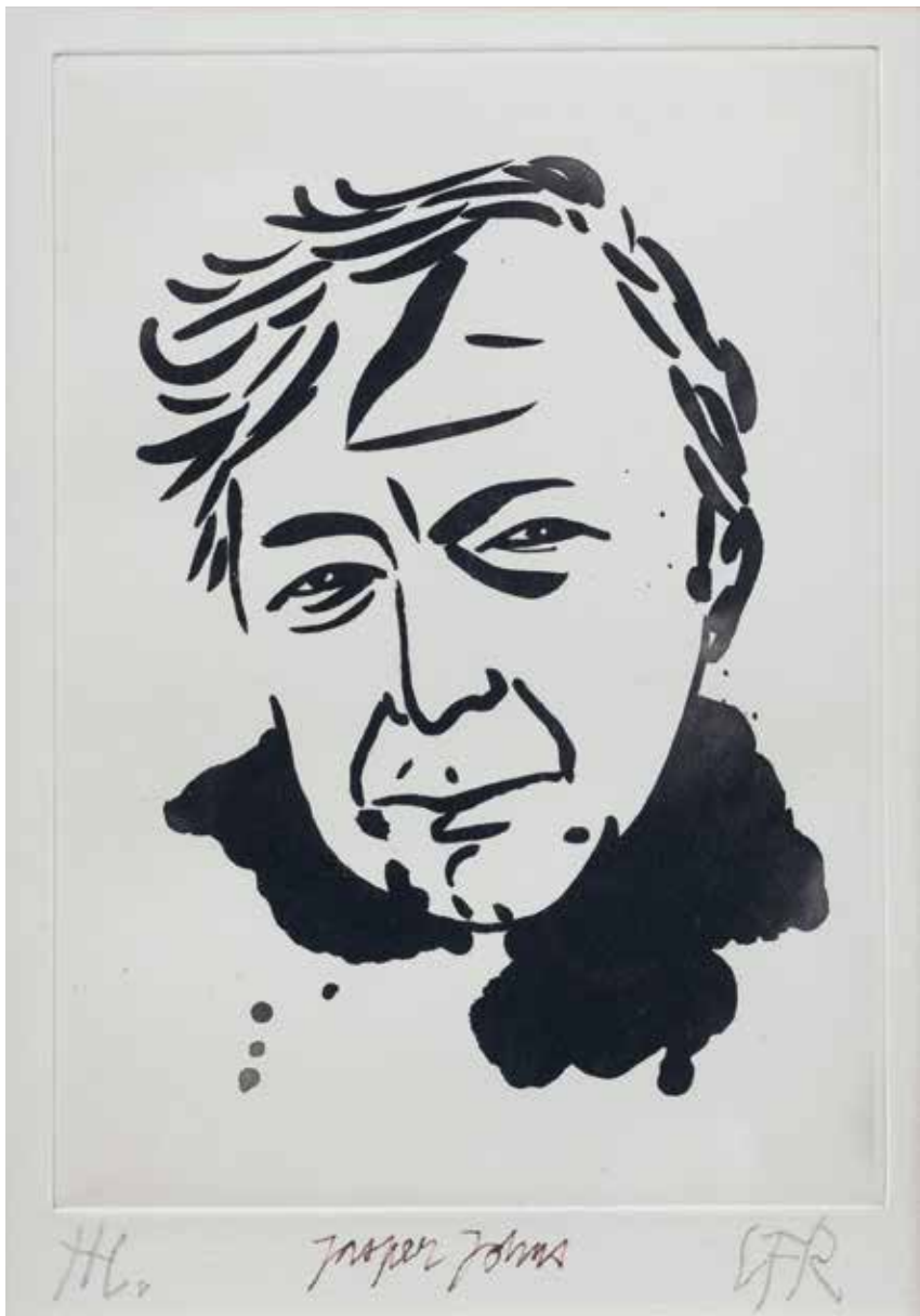
Portrait - "Jasper Johns"