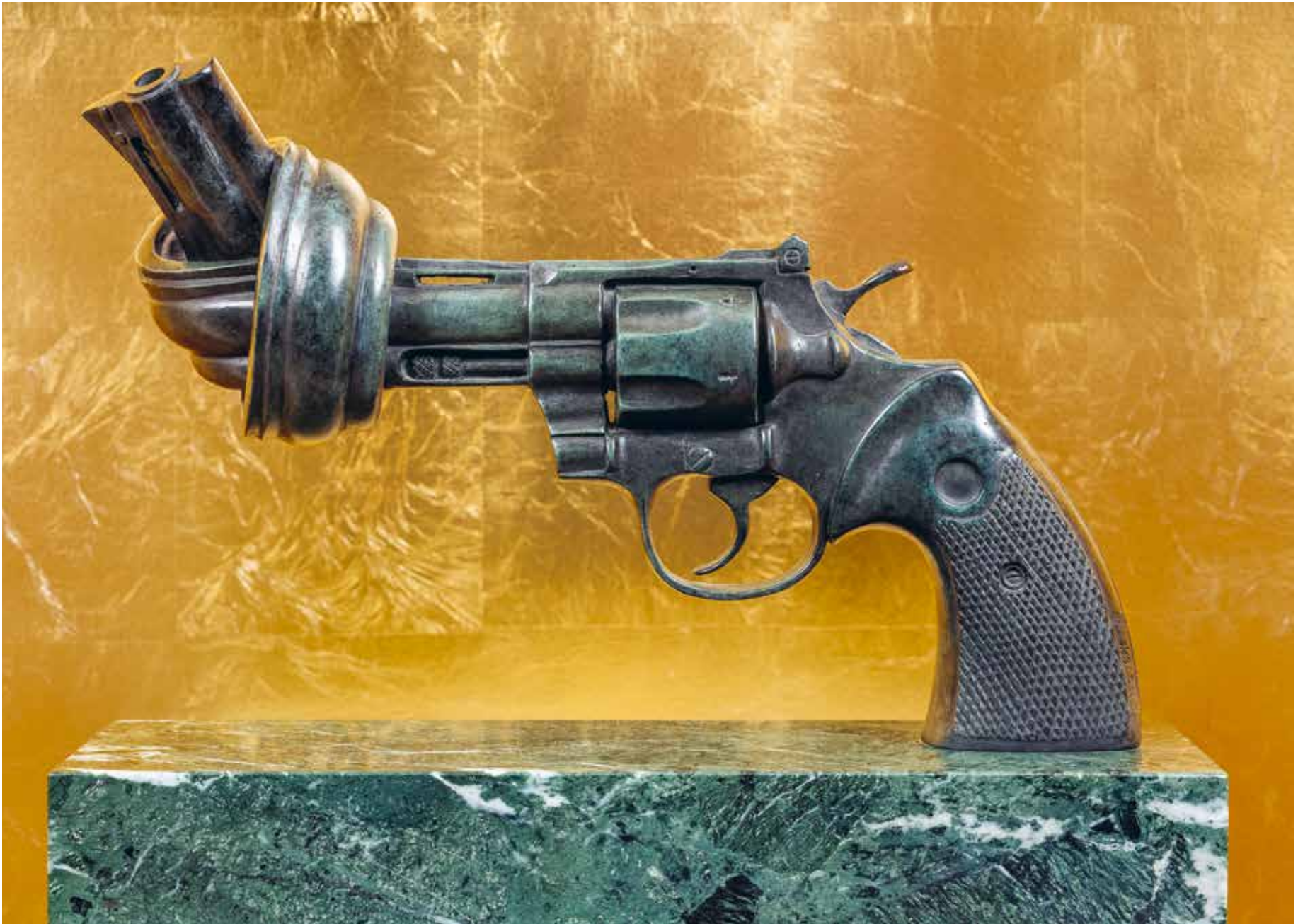
Loungie: "Non Violece - 1985"