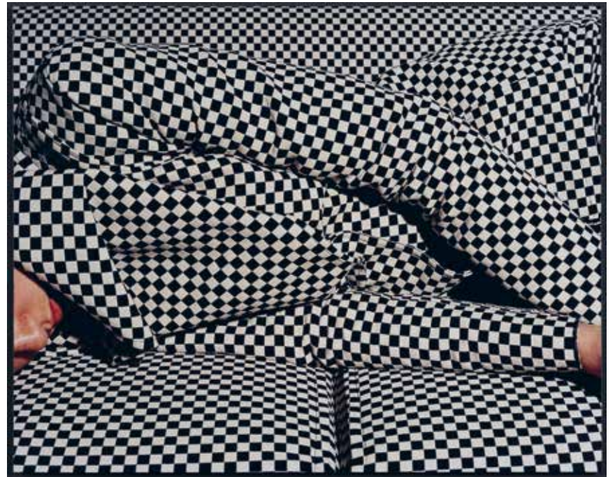
"God Bless The Absentees - Petit Glam"