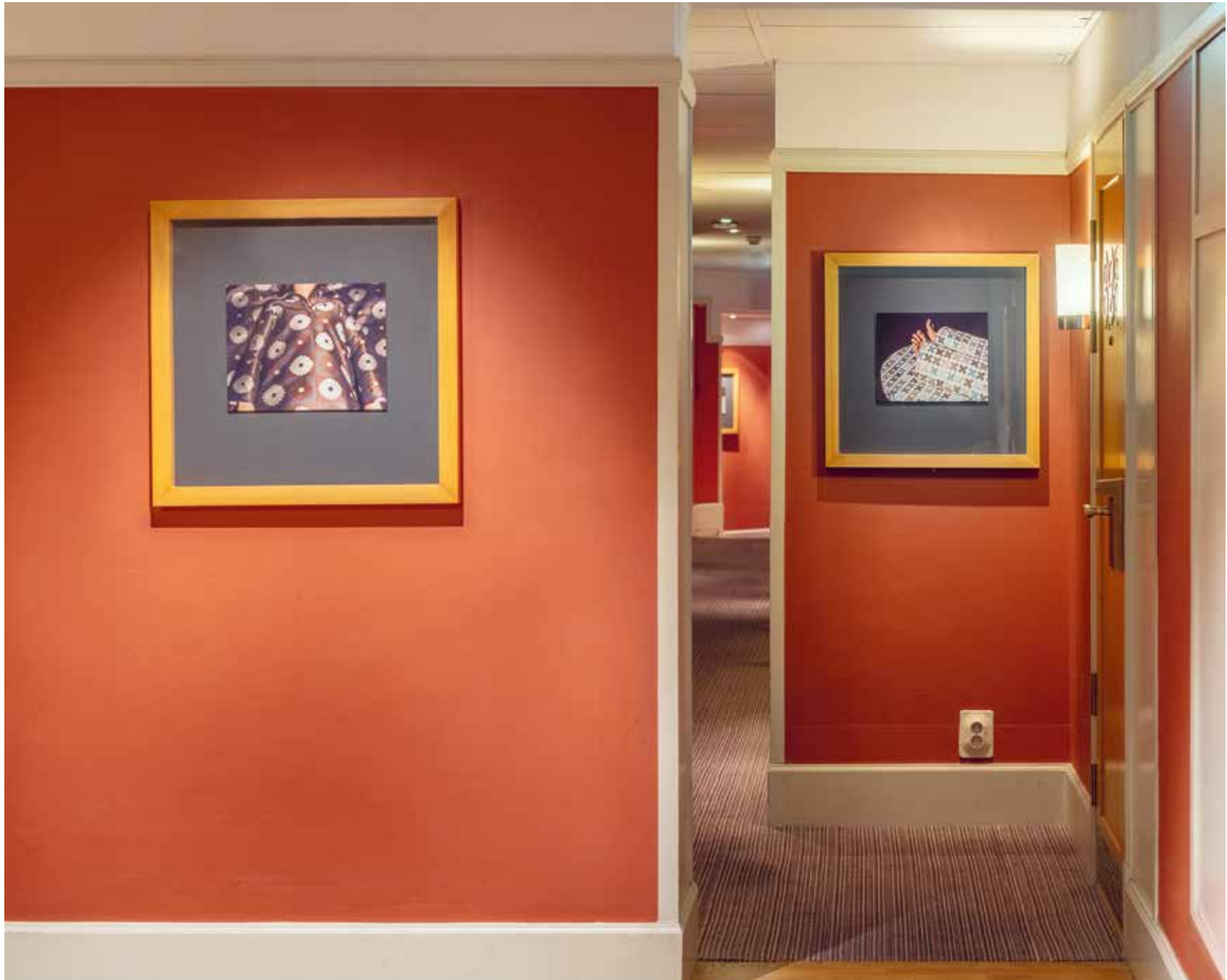
"God Bless The Absentees – Petit Glam"