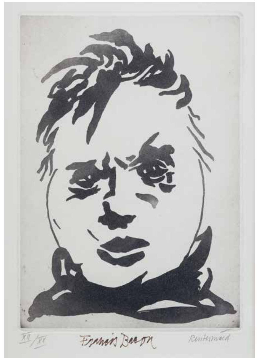
Portrait - "Francis Bacon"